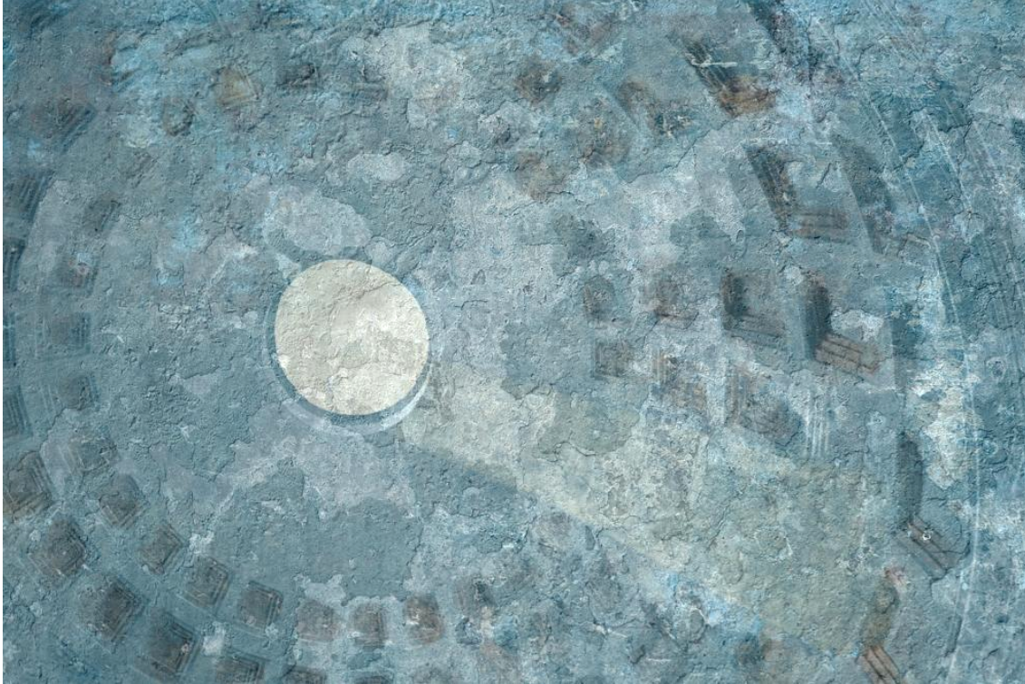
Pantheon Dome Rome, Italy