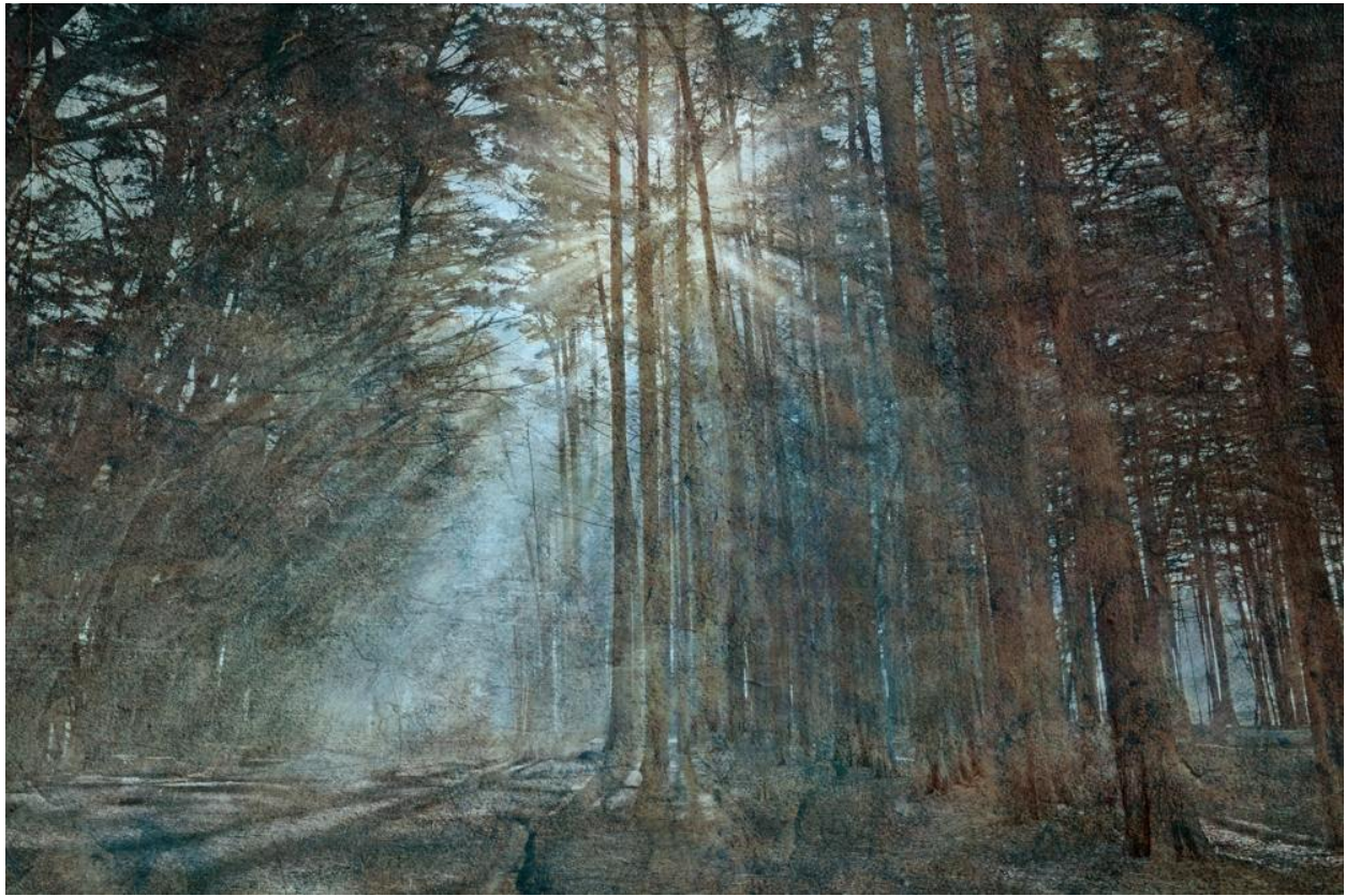
Forest Serenade Moss Beach California © Diane Epstein

Eve remarked, "...when you look at Diane's layering of images you get to create the story, you can delve into memories, you get to solve your own mystery. You can feel the textures, the illuminating beauty that her art brings. It is amazing to watch Diane create her fresco images. Underneath each piece could be 10, 20 layers of art, beginning with a concept, and developing layer by layer."