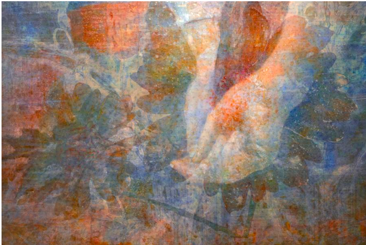
Aquatic Embrace California